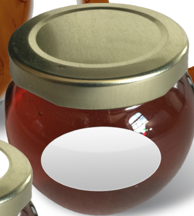
MINI Oval Label