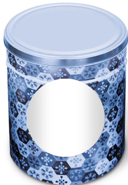
Small Tall Candy Tin 3" Front Label, No Ribbon