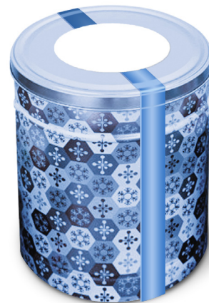
Large Candy Tin with 2" Label and 1" Ribbon