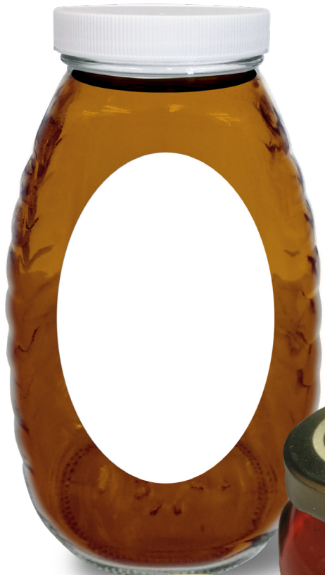
LARGE Oval Label