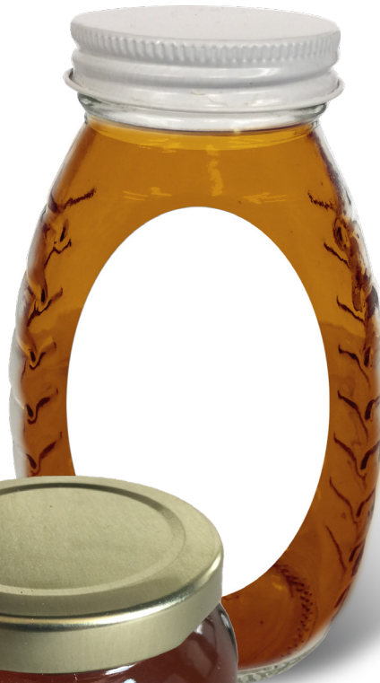
MEDIUM Oval Label