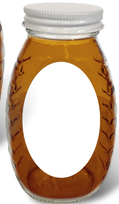
SMALL Oval Label