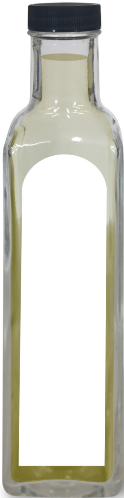
OPTION #1: 1.25"wx 5"h Rounded Top Label