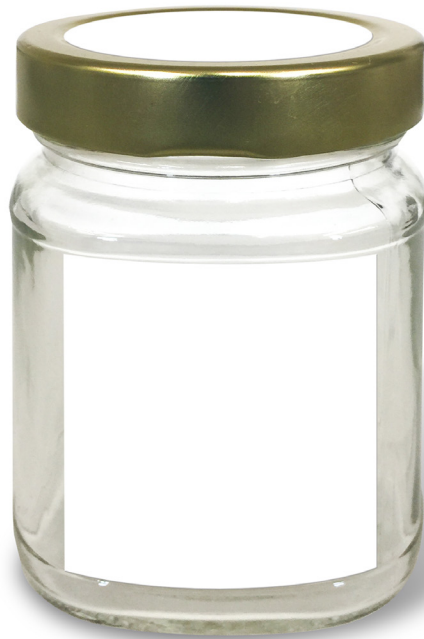
OPTION #2: 2.25"wx 6.5"h Wrap Around 3-Panel Label