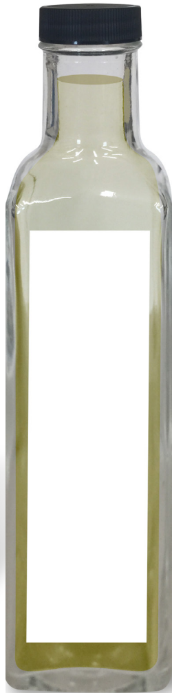
OPTION #2: 1.25"wx 5"h Square Top Label